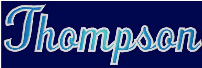
Straight Layout Examples